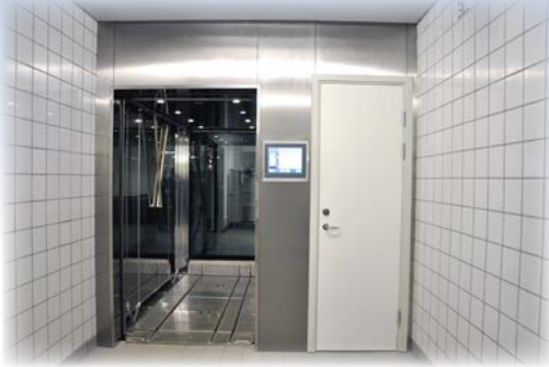
Cart Washer Disinfector 5000