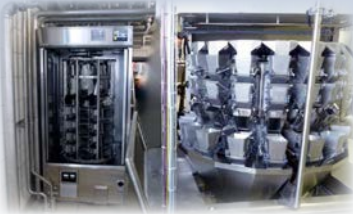
Hopper Cleaner 948