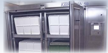
Multi Purpose Washer 50