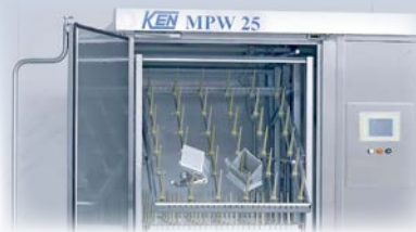
Multi Purpose Washer 25