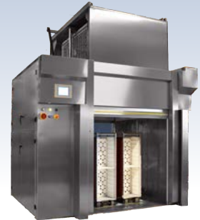
Trolley Cleaner 910 R