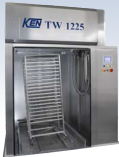
Trolley Washer 1225