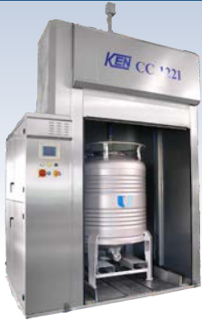
Container Cleaner 1221